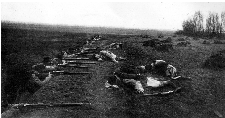
Entrenched soldiers fire over the bodies of their fallen comrades. There is no time to recover the dead.

Frankish commanders attribute the soaring casualties to the