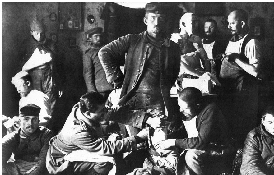
Wounded Frankish soldiers recover at a farmhouse converted into a rude field hospital. The Great War has virtually annihilated an entire generation, and there is no indication the unrest in Russia will halt the devastation for long.